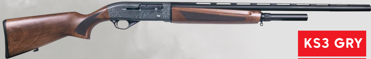
KS3 GRY 12 Gauge