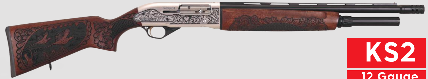
KS2 12 Gauge