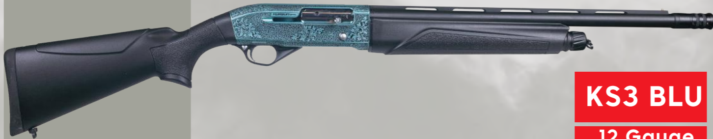
KS3 BLU 12 Gauge