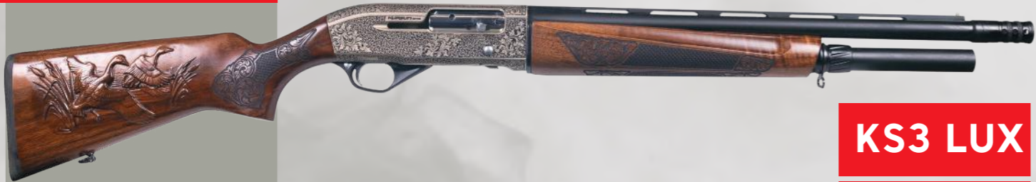
KS3 LUX 12 Gauge