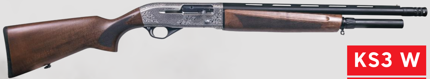
KS3 W 12 Gauge