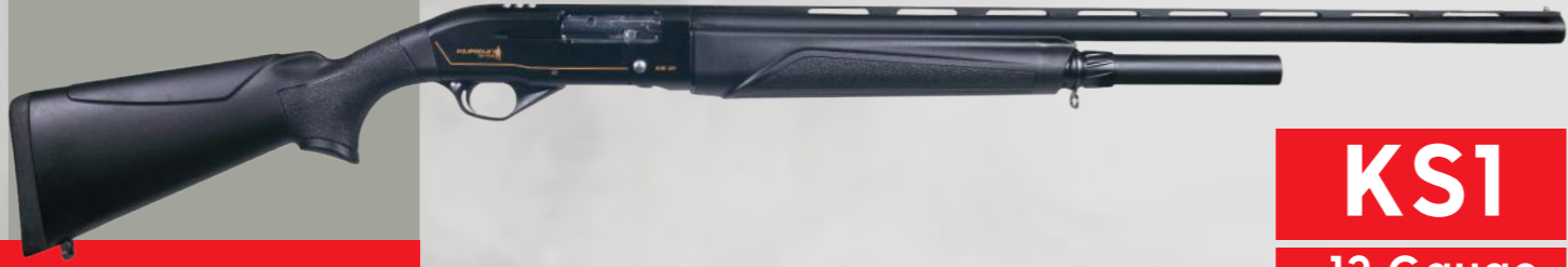
KS1 12 Gauge